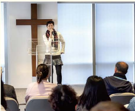
December 15, 2018, Chinese Fellowship Gathering, Wong Chuk Hang 2018年12月15日，黃竹坑聯歡聚會 (中文部)