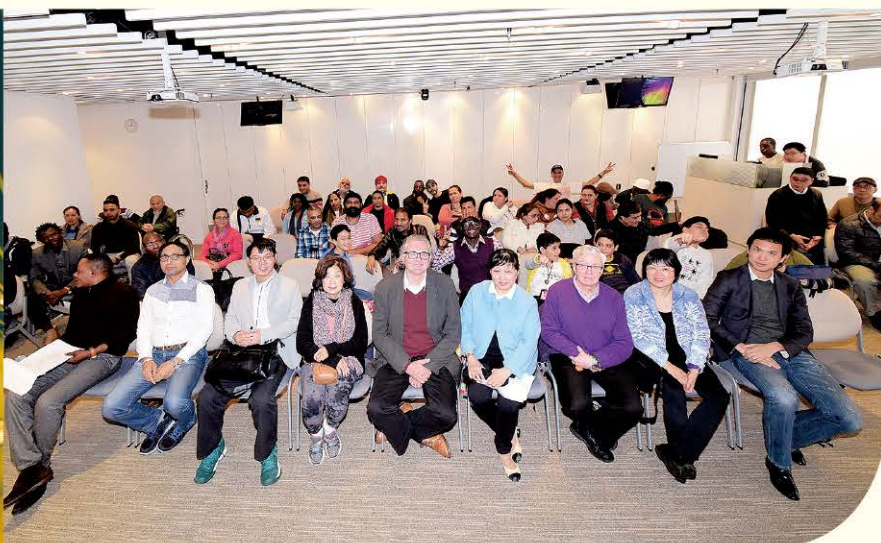
December 17, 2018, Asylum Seekers Christmas Party 2018年12月17日，尋求庇護者聖誕聯歡會