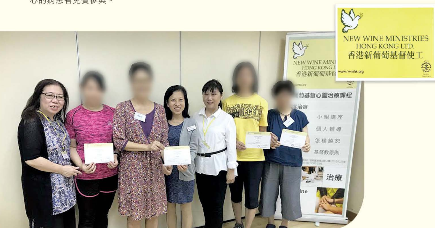
June, 2019, Deep-Level Healing Course at Wong Tai Sin Cancer Centre 2019年6月，深度治療課程， 黃大仙癌協服務中心

Deep-Level Healing Course is vital for the recovery and transformation of life. There are 4 lectures and 3 one-on-one individual sessions with some works conducted by Rev Noreen Siu, the course is based on the biblical principles. The program is funded by NWMHK and a free service for other outreach cancer centres.