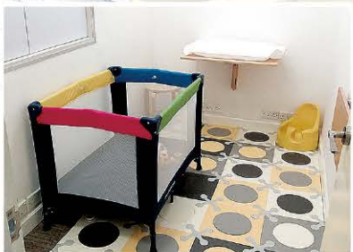
Children and baby room 小童及嬰兒遊戲室