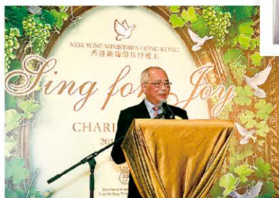
Professor Eddie Ng Hak Kim GBS, JP 吳克儉教授 GBS, JP