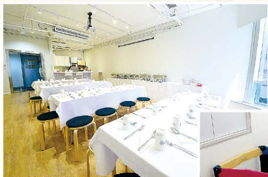
Dining Room 餐廳