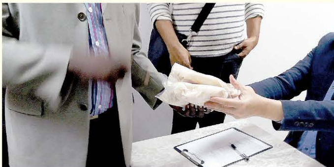
Januray 14, 2019, Rice Giving 2019年1月14日，捐贈派米