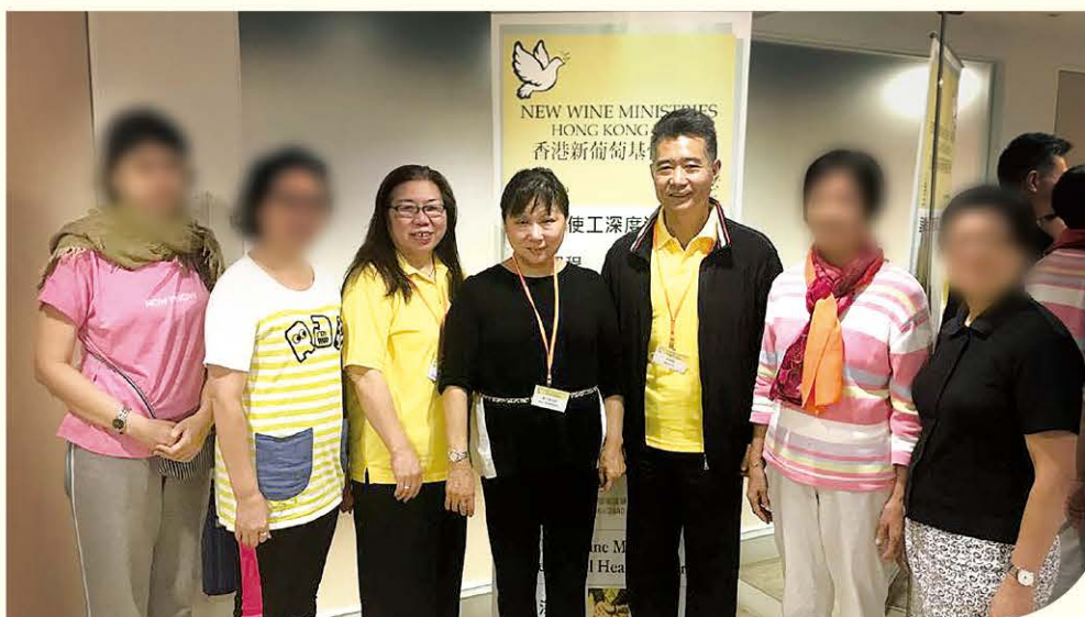
November, 2018, Deep-Level Healing Course

In 2011, many people who came to the ministry for healing had given many testimonies. Healings such as cancers, diabetes, glaucoma, insomnia, chest pain, healing of emotions and healing of anxiety took place for different people.